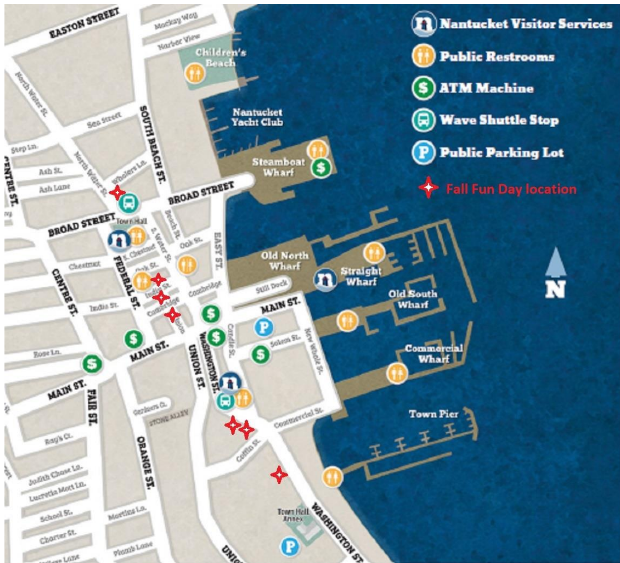
Map courtesy of Visitor's Services